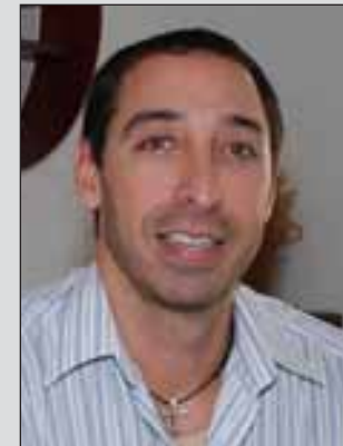
R.J. Kessler Arts & Crafts Center

“Why do you or why do you not support your school sports teams.”